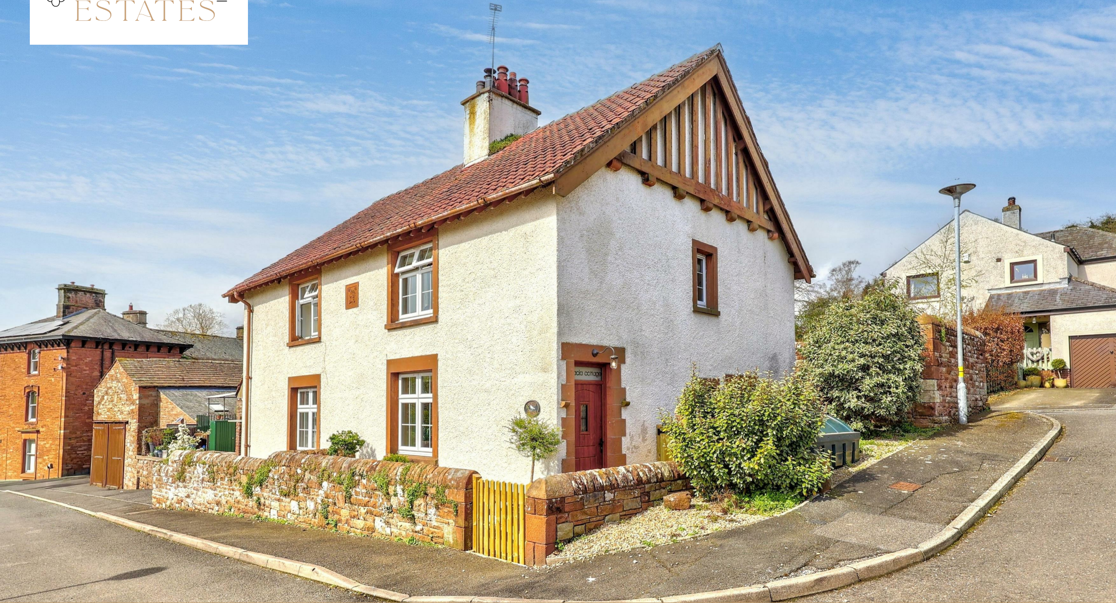
Acacia Cottage 1 Ravenshyll, Penrith, CA10 1DQ